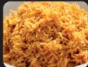
SPECIAL MIX RICE £3.95