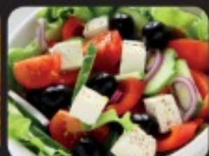
GREEK SALAD £4.25