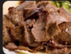
MEAT BOX Lamb | Chicken | Mix £5.25