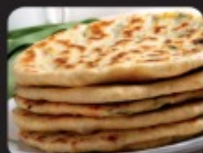
GREEK PITA £1.50