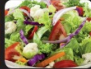
SIDE SALAD £3.75