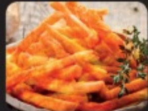
PIRI PIRI FRIES £2.50